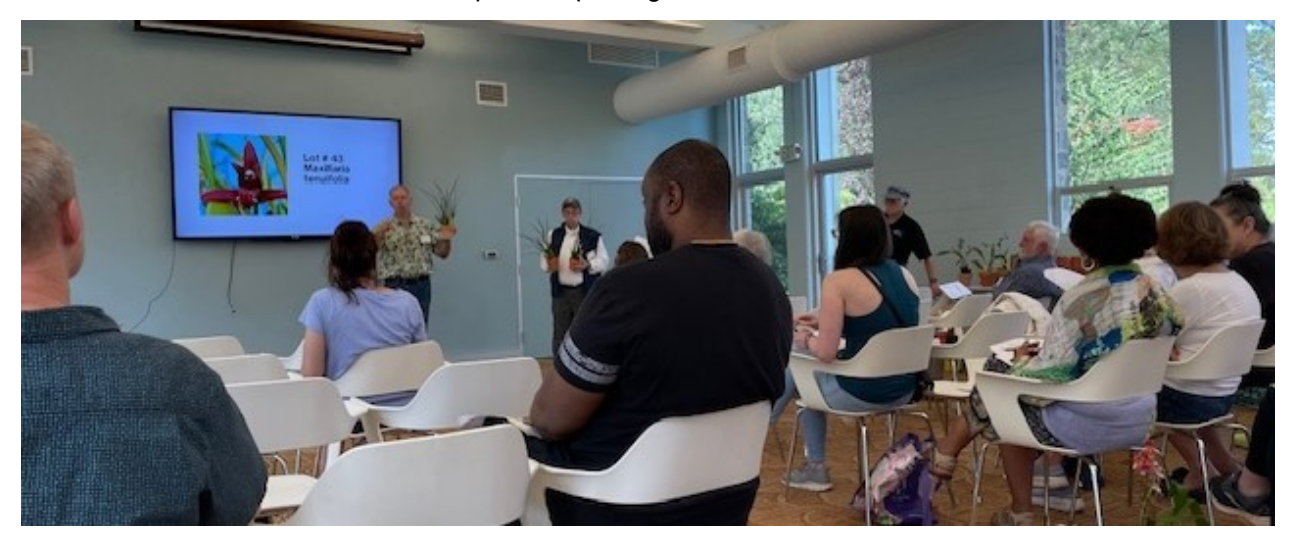
An after action report: All those orchids went to new homes! The Orchids could be heard yelling with joy!