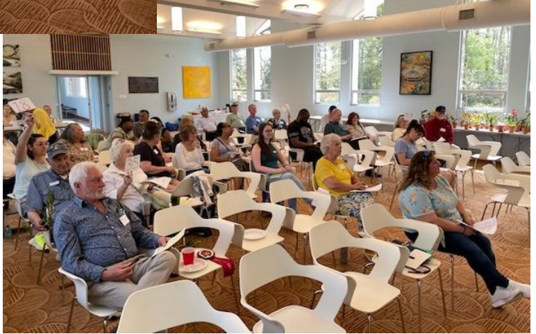
Bidding got intense on many occasions for multiple orchids! A snap shot: count 'em - 4 bidders!