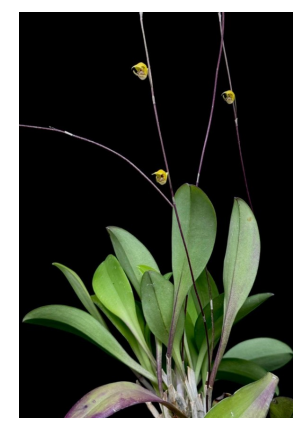
Dylan Wittkower's Scaphosepalum bicristatum