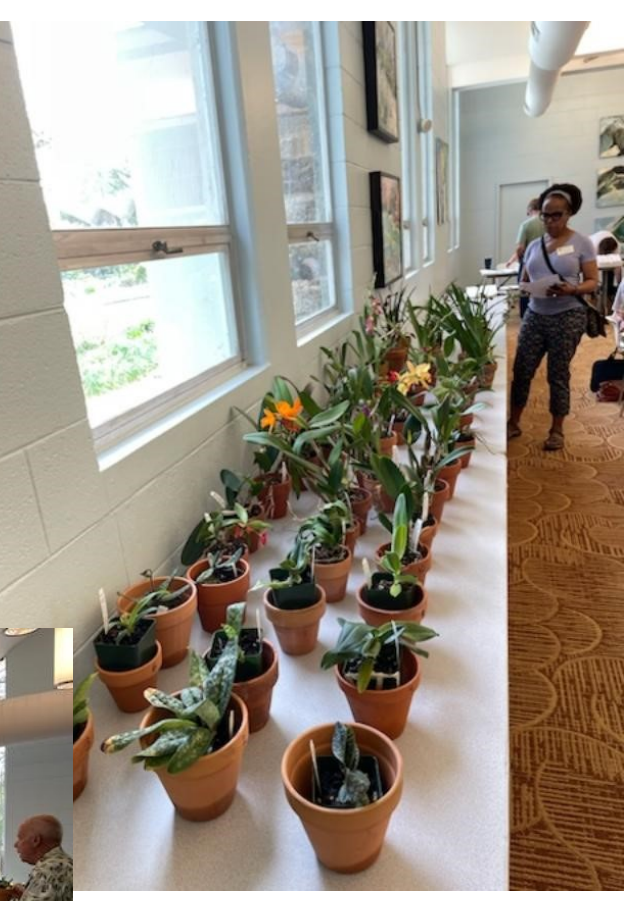
Peney scoping out the choices.