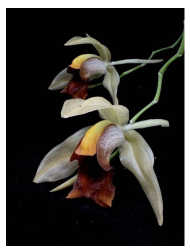
Dylan Wittkower's Coelogyne Lyme Bay (speciosa x usitana)