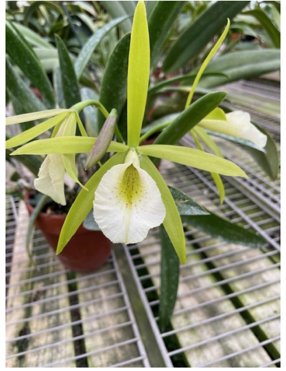
Vijai Singh's Epc Lime Sherbert x B Nodosa