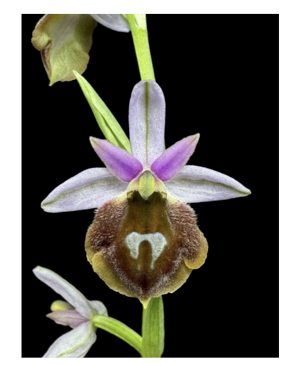
Dylan Wittkower's Ophrys ferrum-equinum