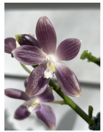
Kathy Greaser's Phalaenopsis specious 'Purple Mountain'.