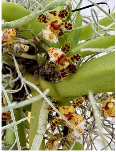
Dylan Wittkower's Gastrochilus bellinis