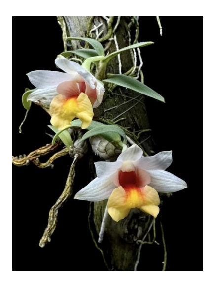
Dylan Wittkower's Dendrobium bellatulum